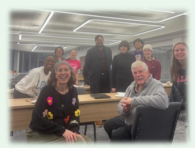
The 1st grant workshop.

LEAPS Hosts the March Membership Meeting – As HPR and LEAPS continue to grow our relationship through collaboration it was decided it would be beneficial for LEAPS to host a HPR monthly membership meeting. The March meeting was selected and proved to be a good one as they arranged to continue to meet with both EGLE and Wolverine Pipeline representatives regarding the December oil spill in Arcada Township. The audience was sizable (roughly 50 members. public, and college students) and the questions were excellent as the scope of the oil spill, containment procedures, prevention measures, and further investigation were all discussed. It was an excellent meeting hosted by LEAPS!